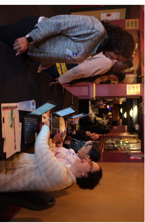
Staff checking in to the January 11, 2018 strategic plan and staff appreciation event