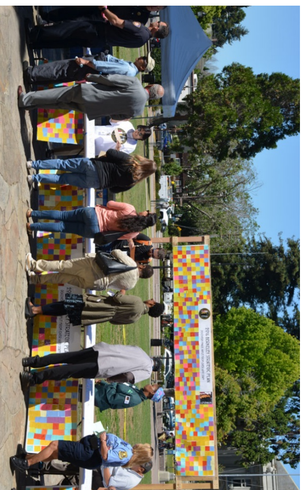
City staff providing input on the Berkeley Strategic Plan